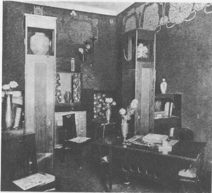
Josef Hoffmann, an Art Nouveau interior, 1899: "The individuality of the owner expressed in every ornament . . . this is what it means to go about life living with one's own corpse" (Adolf Loos).

Adolf Loos and I – he literally and I linguistically – have done nothing more than show that there is a distinction between an urn and a chamber pot and that it is this distinction above all that provides culture with running-room [ Spielraum ]. The others, the positive ones [i.e., those who fail to make this distinction], are divided into those who use the urn as a chamber pot and those who use the chamber pot as an urn. 3